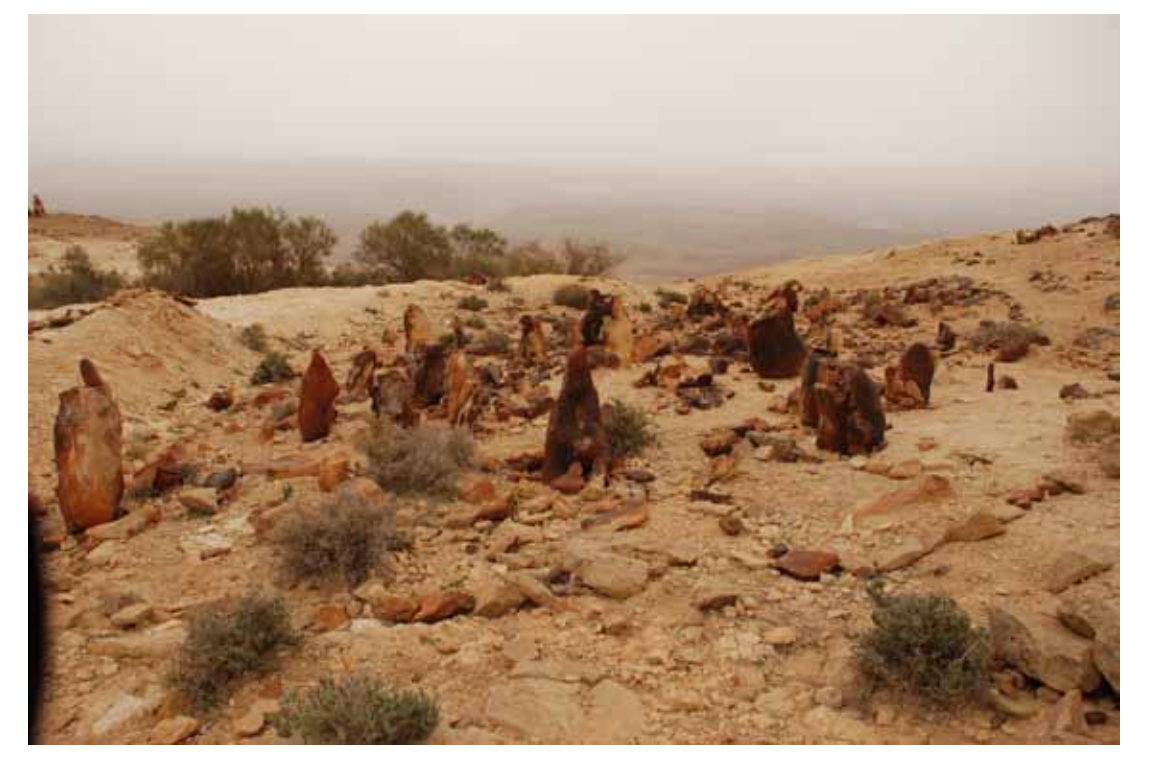
Figure 2: HK/86b – the flint pillars with the geoglyphs in front