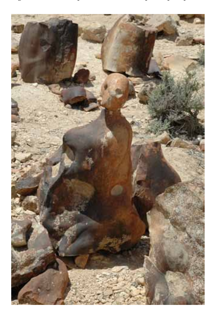
Figure 3: HK/86b – particular of an anthropomorphic pillar