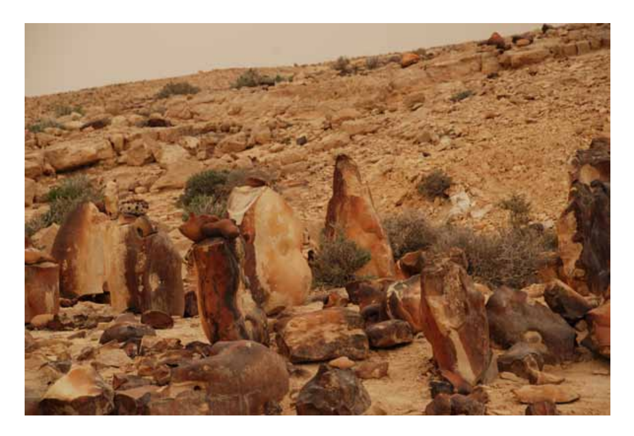
Figure 4: HK/86b - particulars of anthropomorphic pillars